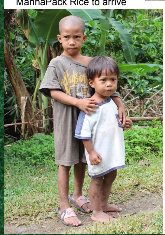
Five-year-old begging for food for his family