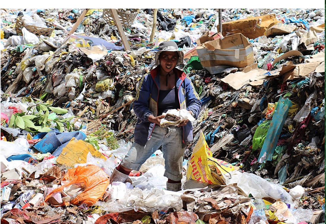
Another mother of five children scavenging for something to eat or of value to sell for food in the same garbage dump.

At the Maasin City garbage dump we met a little one-year-old who really touched our hearts. She has been on our feeding program for four months now and is finally getting healthy again despite her terrible living conditions.