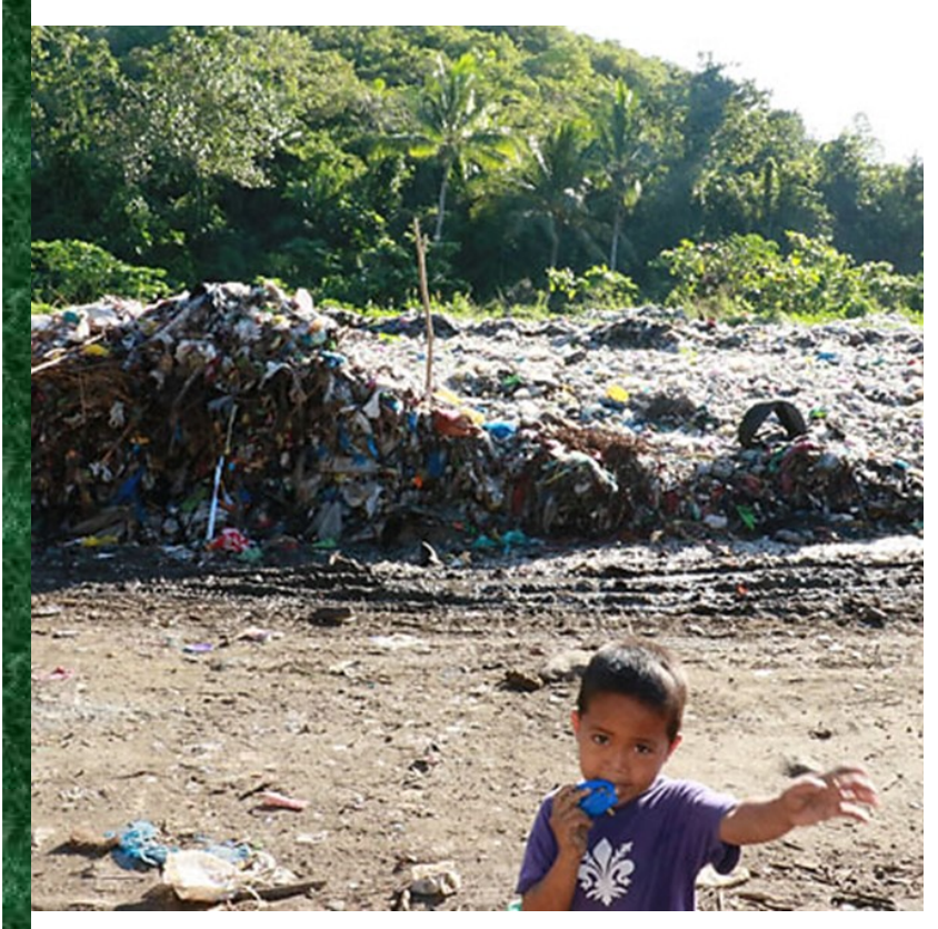
A child reaches out from the sea of garbage. Will someone help?

Please pray for these extremely poor people and the RSM volunteers that minister to them. Please pray that more donors and volunteers here in America will come to their aid and give them a loving hand up out of their misery.